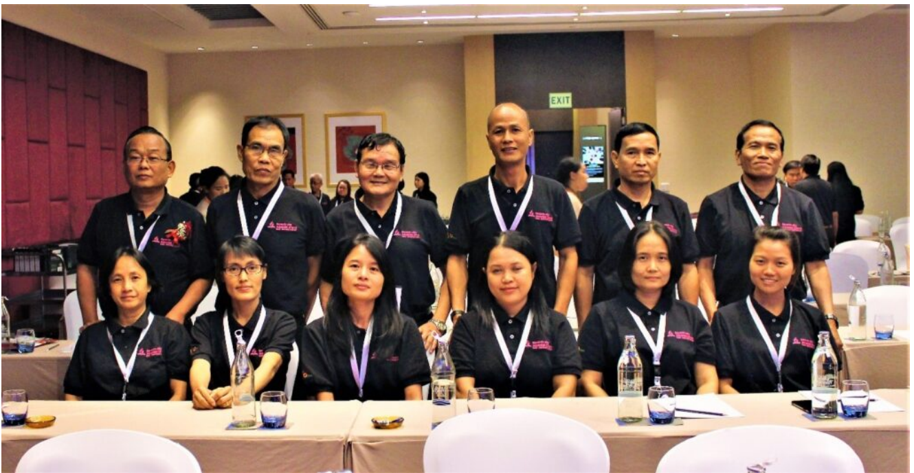
MYUM Secretary Staff in the Conference Room