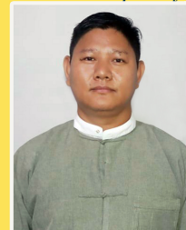
Mang Sian Tuang Youth Ministry