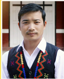
Teint Saung Communication PARL/AWR