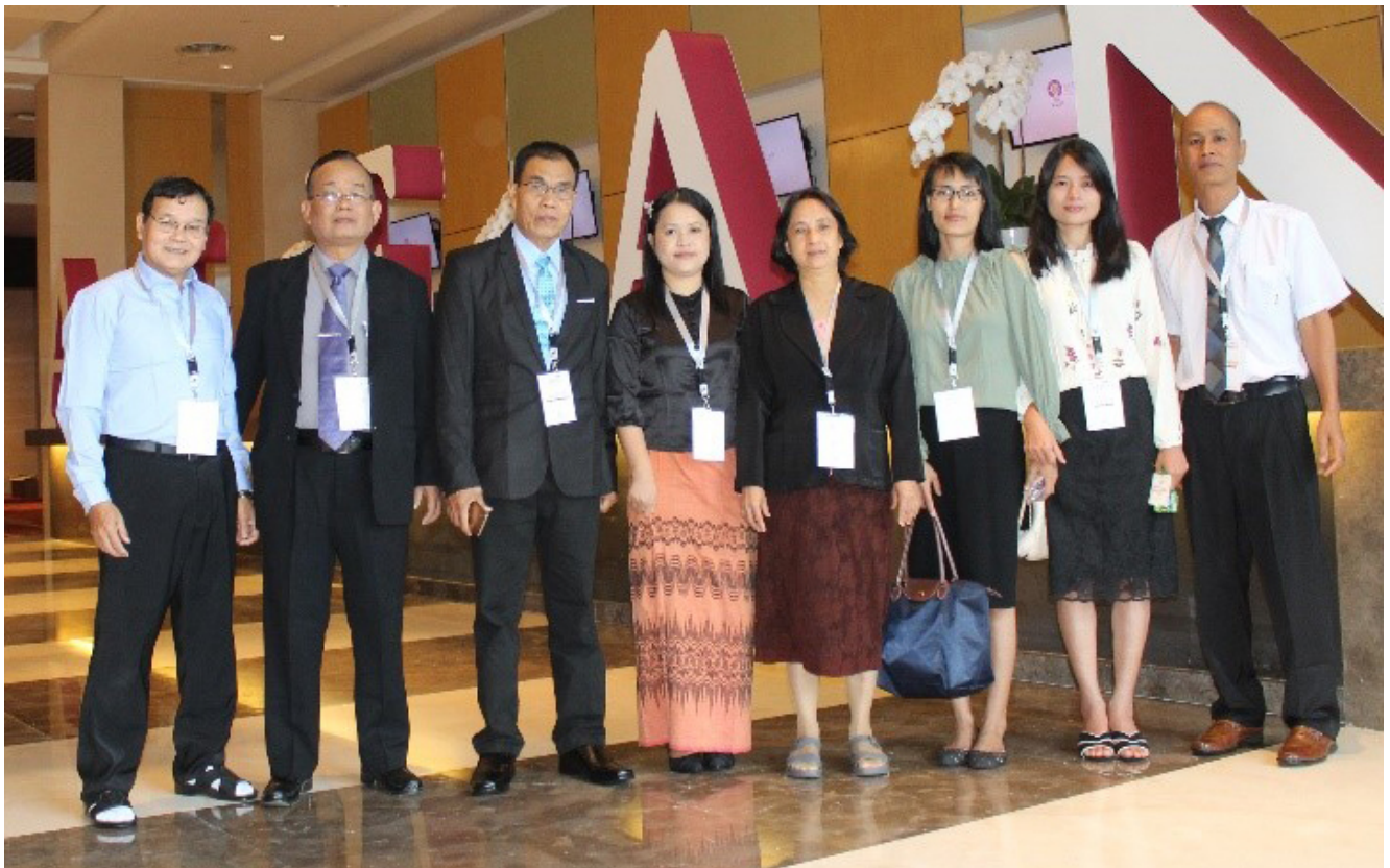
The Secretariat Delegates from Myanmar in the Central World

To the praise of God's grace, the Myanmar Union Mission was granted the Division Cooperative Union Performance Achievement Award in Second Place. Praise God for His kind guidance in His ministry.