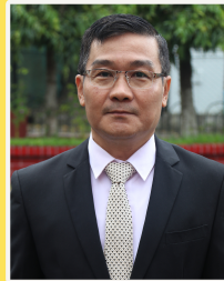
Sernay Nyunt Health Ministry