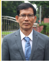
Morris Chit Education