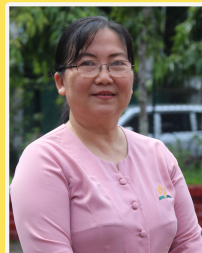
Sohila Shine Women's Ministry Family Ministry