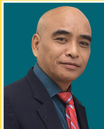
Suan Sawm Sang Publishing Spirit of Prophecy