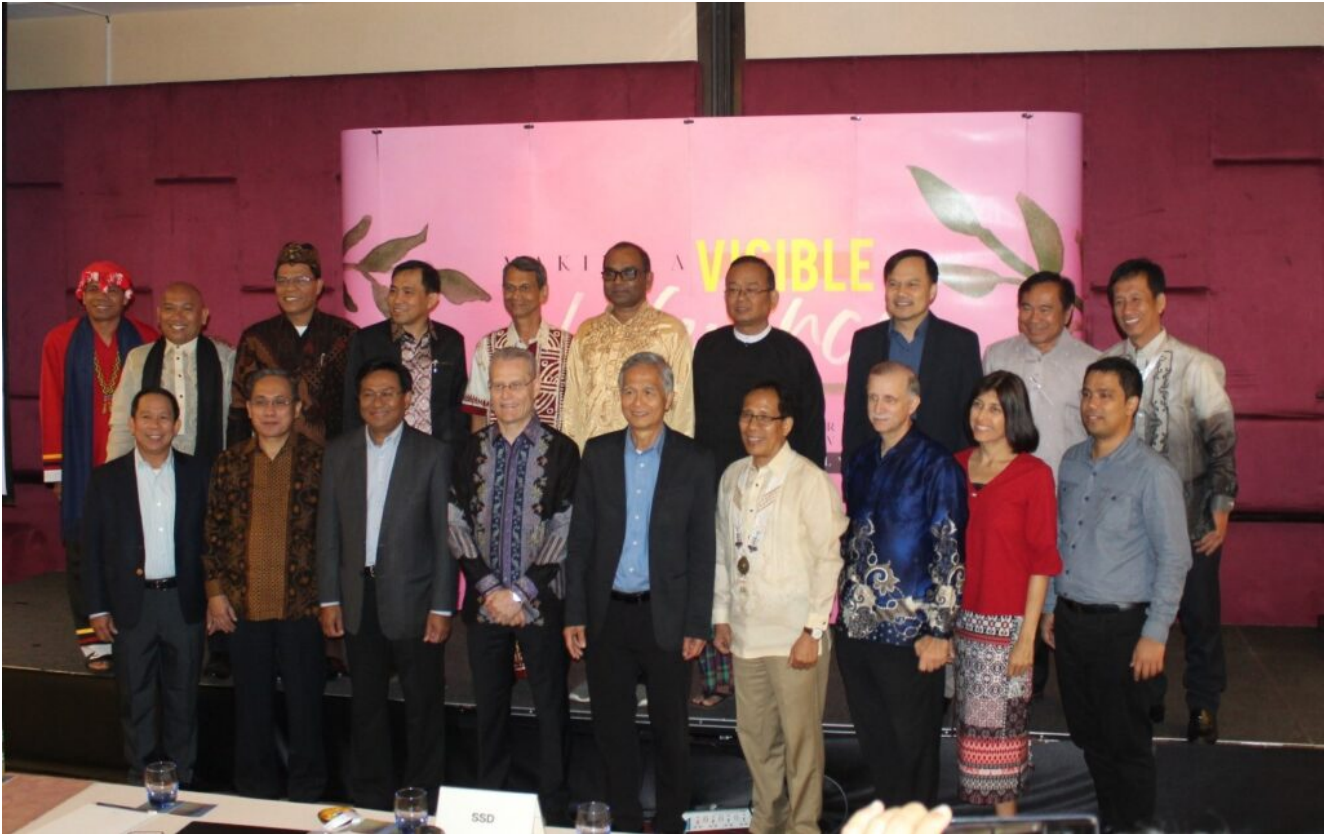
Executive Secretaries in SSD Territory with SSD Officer Staff